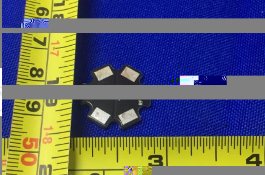
Fig. 1 - Overall view of the sample